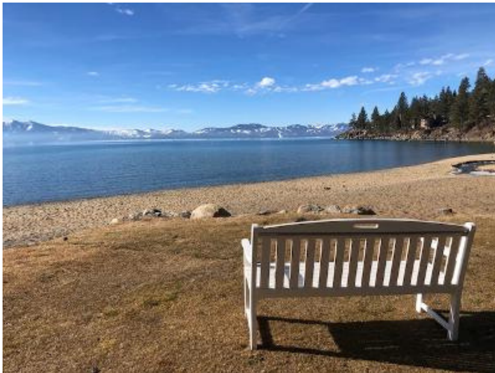
Beautiful view from China Garden Beach