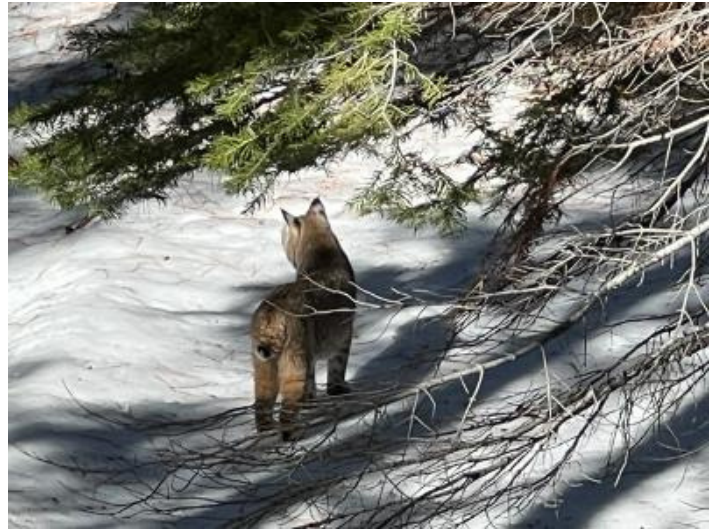
Winter residents of Glenbrook include this stunning bobcat, sighted often by many residents

– The US Forest Service has a proposal to open a new recreation area for winter snowmobiling at the juncture of SR28 and US Highway 50. This area would only be separated by 1/4 - 1/2 mile from Glenbrook. The GHOA and GCTA Boards sent a letter in early February to the US Forest Service expressing our deep concern about the potential impact of this project including: